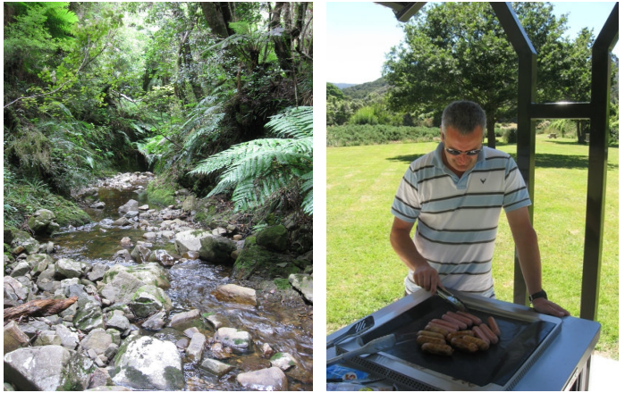
Restoring a forest for future generations How you can help: